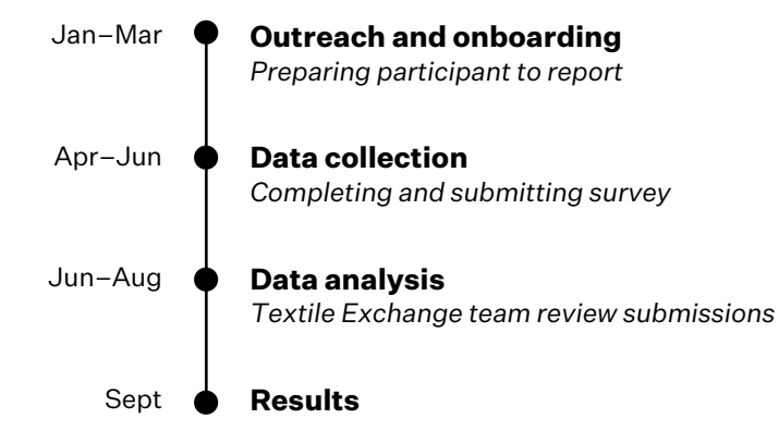
Figure 1: Materials Benchmark timeline (overview)

Here is an overview of the 2025 timeline: