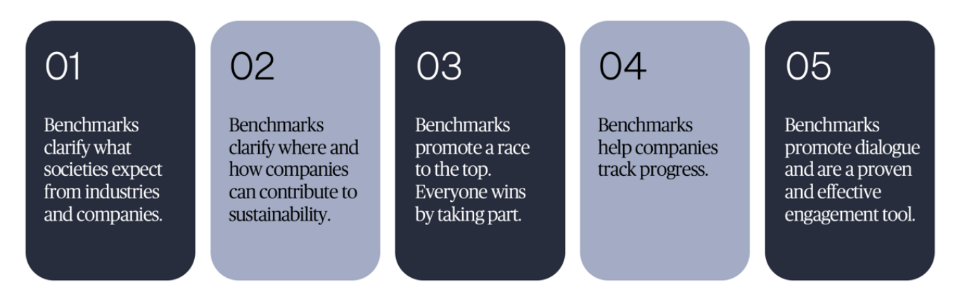
Figure 4: The above five benefits of benchmarking are from the World Benchmarking Alliance, of which Textile Exchange is a proud ally. For further details visit the World Benchmarking Alliance <u>here</u>.