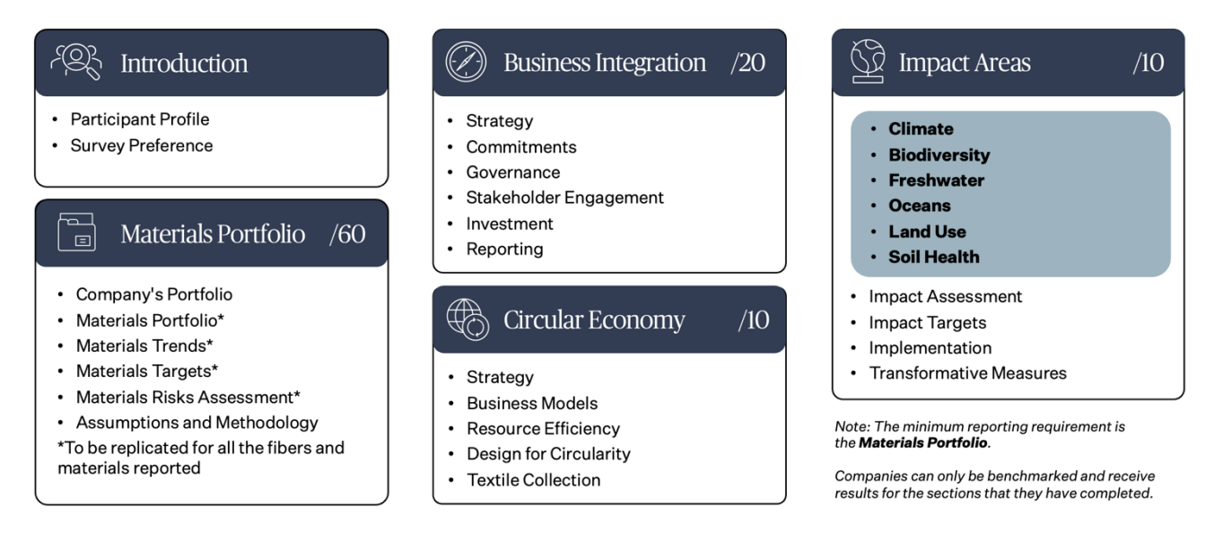
Figure 3: Materials Benchmark framework

The 2023-25 Materials Benchmark survey comprises three sections: Materials Portfolio , Business Integration & Circularity , and Impact Areas , which are further divided into subsections indicated in the image below: